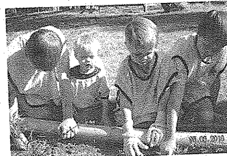
Some of the younger volunteers help pull weeds.